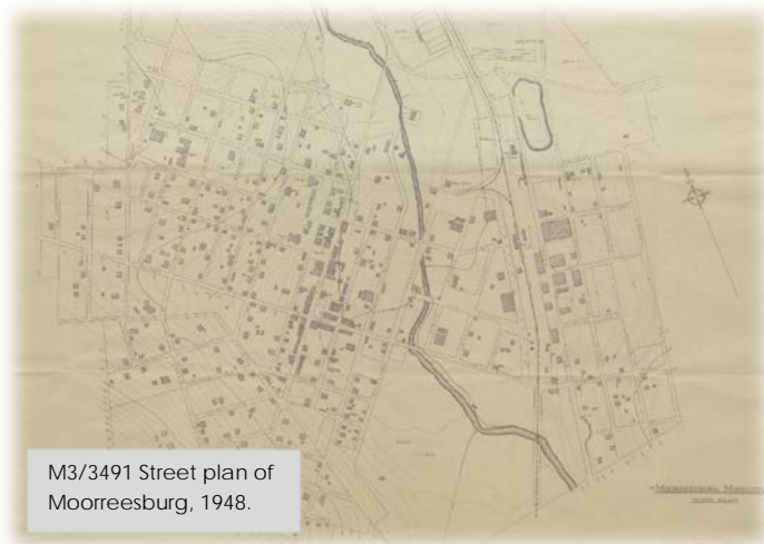
M3/3491 Street plan of Moorreesburg, 1948.