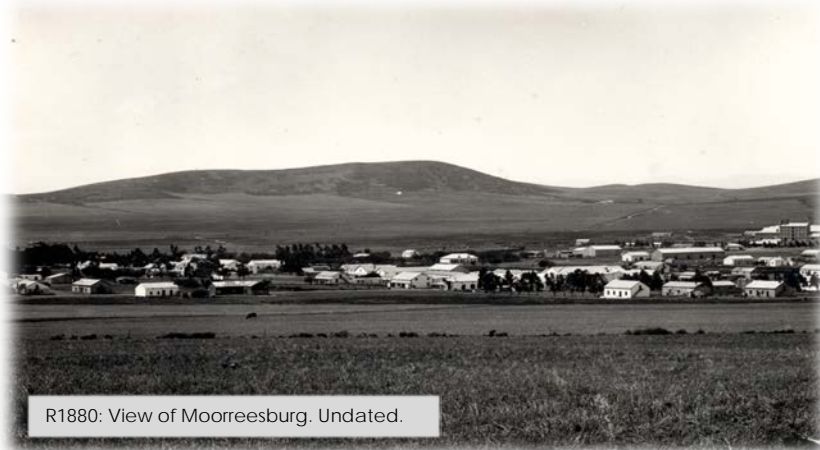
R1880: View of Moorreesburg. Undated.

The Western Cape Archives holds the memory of our province with more than 45kms of records. This flyer will help you identify some of the main sources of historical information available to researchers in the Western Cape Archives, specifically on Moorreesburg and its inhabitants.