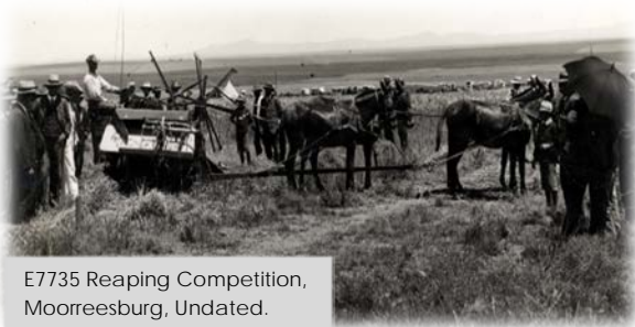
E7735 Reaping Competition, Moorreesburg, Undated.