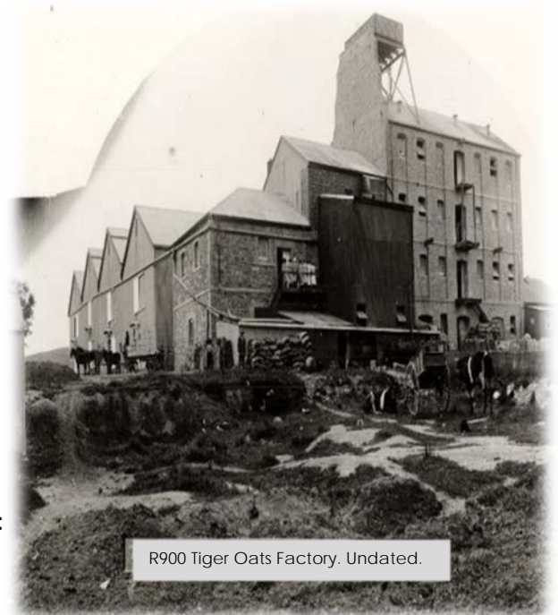
R900 Tiger Oats Factory. Undated.