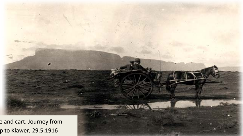
Dr J833 Horse and cart. Journey from Vanrhynsdorp to Klawer, 29.5.1916