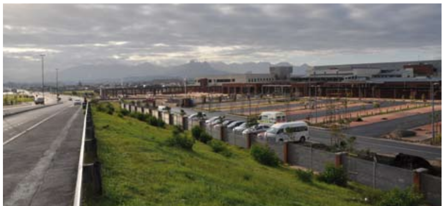
NEW DAWN: A view of the Khayelitsha Hospital from the bridge next to the facility.