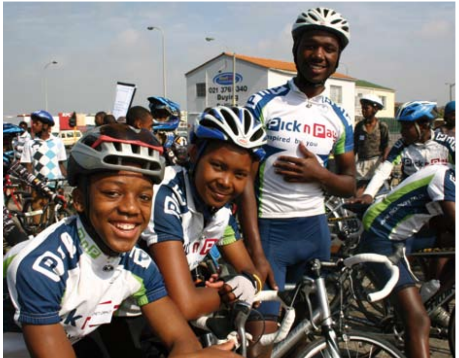
DON'T FORGET THE HELMET! A good quality helmet reduces the risk of death from a road crash by almost 40 percent.

increase in road traffic deaths and reductions in deaths due to other health conditions. (Facts supplied by the World Health Organisation)