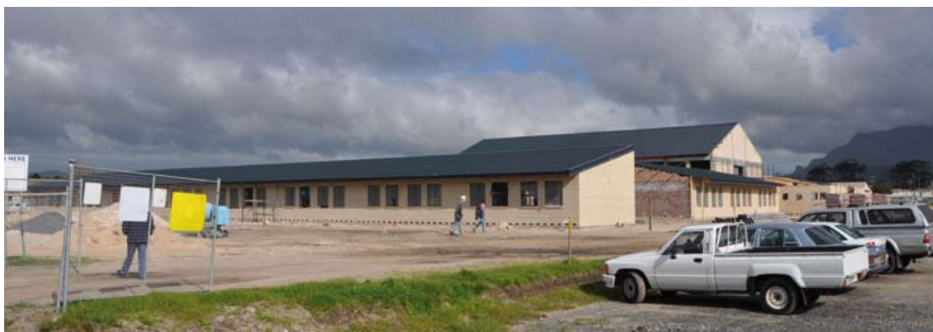
The new entrance to the Oaklands Secondary School.