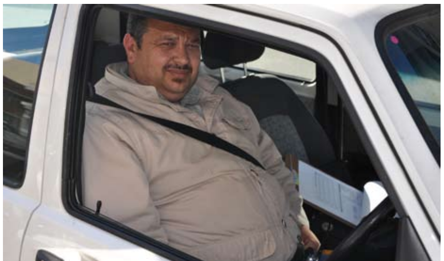
BUCKLE UP: Many South Africans completely ignore the value of safety belts. It is advised that children in the backseats should also buckle up.