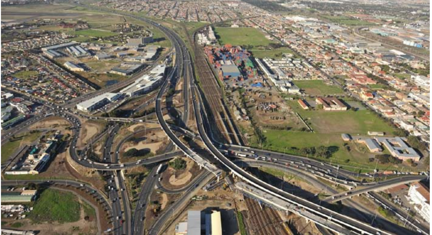
ONE LINK STILL TO GO: The aerial photograph shows how a piece of Ramp B of the Koeberg Interchange still needs to be put in place. Traffic flows easier since the completion of the ramp.