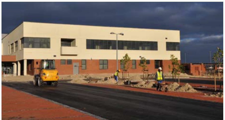
Workers are planting trees at the parking areas at the Khayelitsha Hospital.