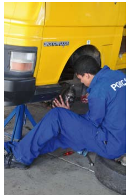
BUSY BEE: One of the 2011 apprentices busy with maintenance to a departmental vehicle.

a term of seven years), but some would spend time as a journeyman and a significant proportion would never acquire their own workshop.