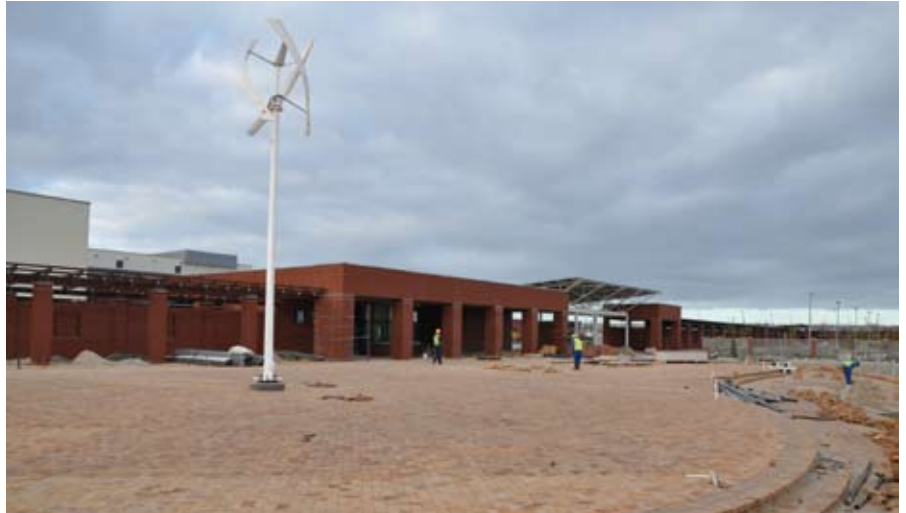
PAVING THE WAY: Workers are paving the front entrance of the Khayelitsha Hospital. The hospital will provide health services to more than 3.9 million people once it is completed.