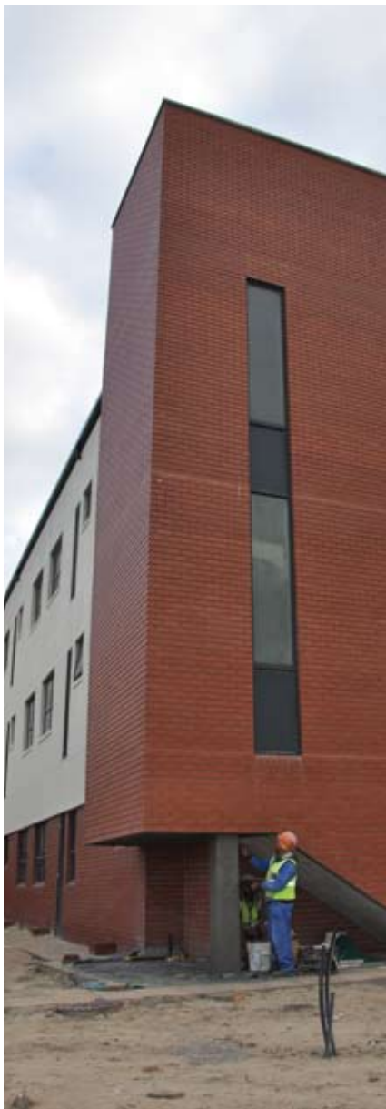
FINISHING TOUCHES: A plasterer puts the finishing touches to a column at the back of Khayelitsha Hospital. More than 5000 jobs were created since construction started in 2009.

Contractors are busy putting the final touches to the site. The landscapers are planting trees and shrubs to beautify the area around the building.