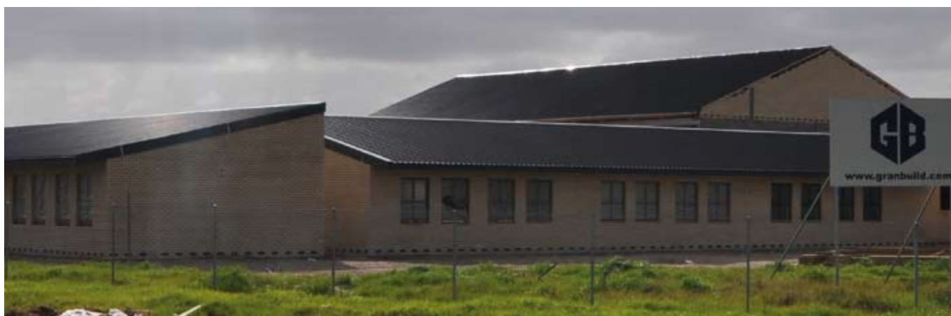
A side view of the new Oaklands Secondary School. The new school is replacing the run-down prefabricated structure.

The Department has an ongoing programme of building schools and at the end of June 2011 it completed additional classrooms for Grade R pupils at seven schools. The schools are Dalubuhle Primary in Franschoek, Langabuya and Mbekweni Primary Schools, Simondium Intermediate and Sonop Primary Schools in Paarl, Pineview Primary School in Grabouw, and Lukhanyo Primary School in Hermanus.