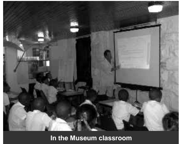
In the Museum classroom