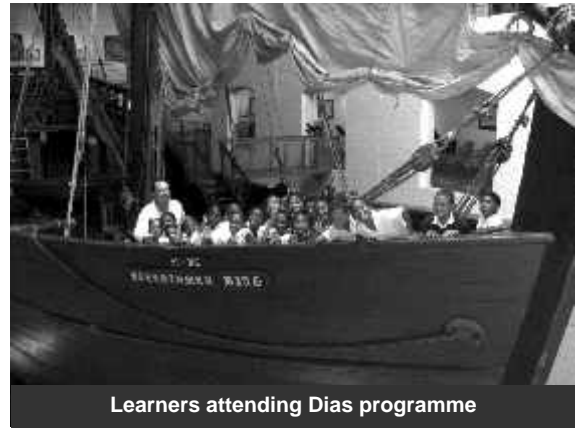
Learners attending Dias programme

We are looking forward to their visit next year.