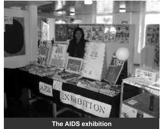
The AIDS exhibition

All these activities started on the 1st and ended on the 31st December 2009 as both parties regard December as AIDS month. The good about this initiative is that it does not only target the local people but also foreign tourists. Everybody was welcomed to come to the museum and learn.