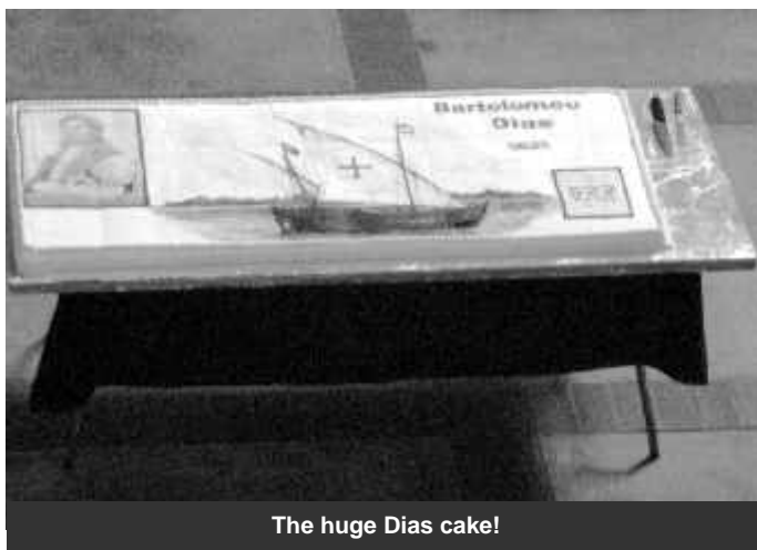
The huge Dias cake!

To receive a Navy delegation in Mossel Bay after a 12 year absence was a great honour and a wonderful learning experience.