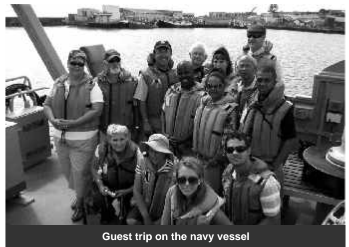
Guest trip on the navy vessel