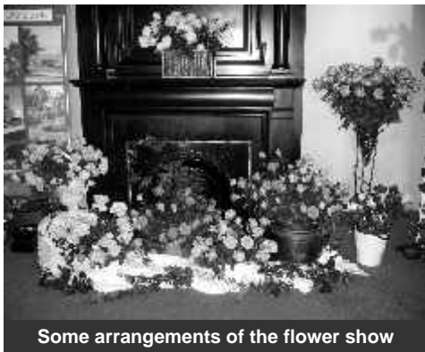
Some arrangements of the flower show

The organisers want to thank everyone for entering their flowers and plants and for all the hard work put in to ensure the success of the festival.