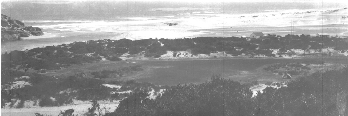
AN EARLY PHOTOGRAPH OF THE ISLAND CIR 1900. THE CENTRE OF THE ISLAND WAS THEN COVERED WITH WATER. THE ISLAND MUST HAVE CHANGED SHAPE OVER THE YEARS AND AN EARLY MAP SHOWS THE ISLAND SPLIT IN TO TWO PARTS WITH A CHANNEL DOWN THE MIDDLE.

THIS HAS BEEN A BUSY MONTH AND NISDE IS AWAY ON LEAVE