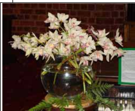
The Orchids seen above are alongside the vintage pedal organ.