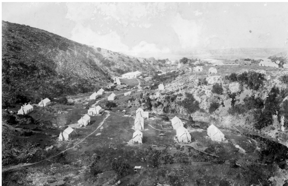
Looking down from the Heights, Great Brak River cir 1910. "Showing the original workers cottages built by the Searles.