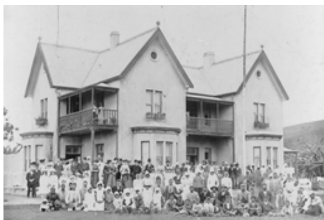
Above, 'Westbank' in about 1900 before the many additions. On the right 'Westbank' before the latest restoration work.