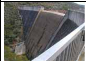
Great Brak River's Wolwedans dam wall.

The Department of Water Affairs and Forestry reports that during the last week in July 2009, our Wolwedans dam is 44.90% full. The bottom 15% layer is presently not suitable for purification.