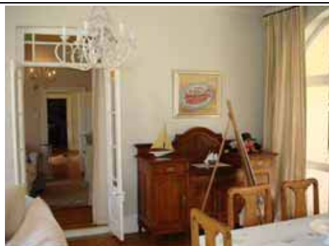
.One of the many entertainment areas decorated in a simple yet elegant style.

On the right, the main entrance archway overlooking the front garden and the river.