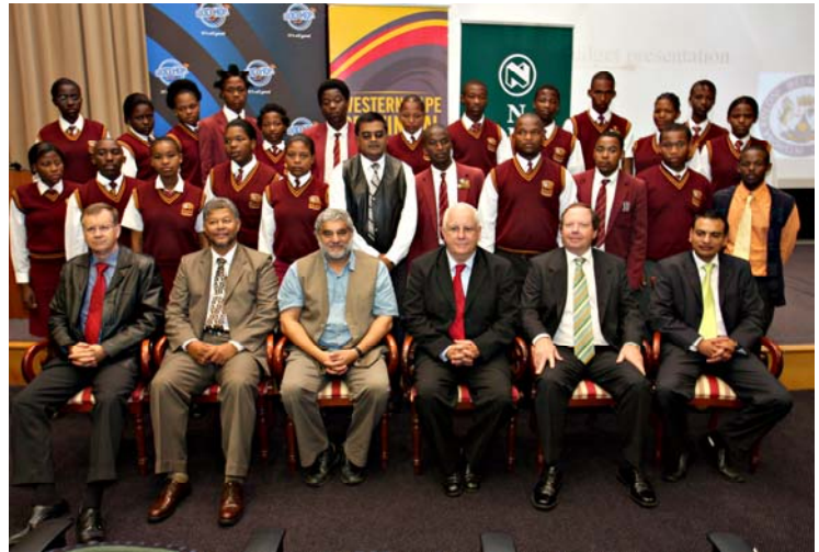
Representatives from Provincial Treasury, the WCED and Nedbank with learners from Masibambane Senior Secondary School.