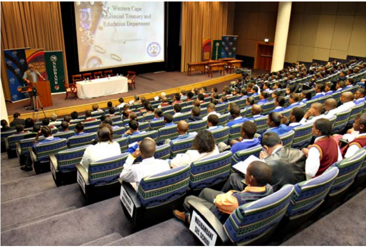
The Auditorium at the Nedbank Clocktower was filled to capacity.