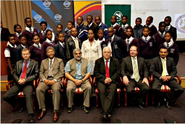
Representatives from Provincial Treasury, the WCED and Nedbank with learners from Hector Pietersen Senior Secondary School.