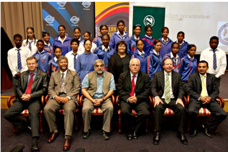
Representatives from Provincial Treasury, the WCED and Nedbank with learners from Uitsig Senior Secondary School.