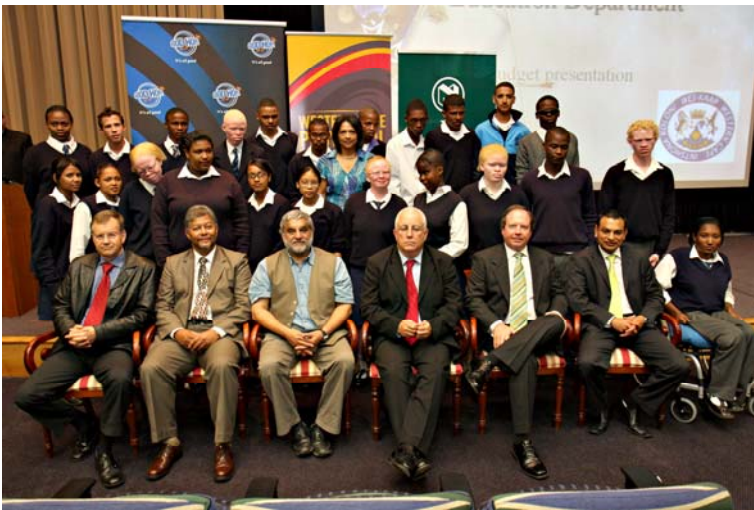
Representatives from Provincial Treasury, the WCED and Nedbank with learners from The Athlone School for the Blind.