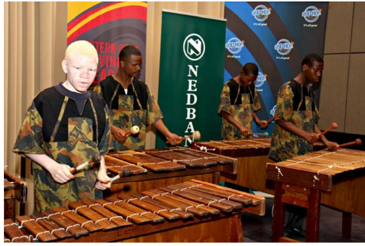
The Marimba Band from The Athlone School for the Blind, kept guests entertained.