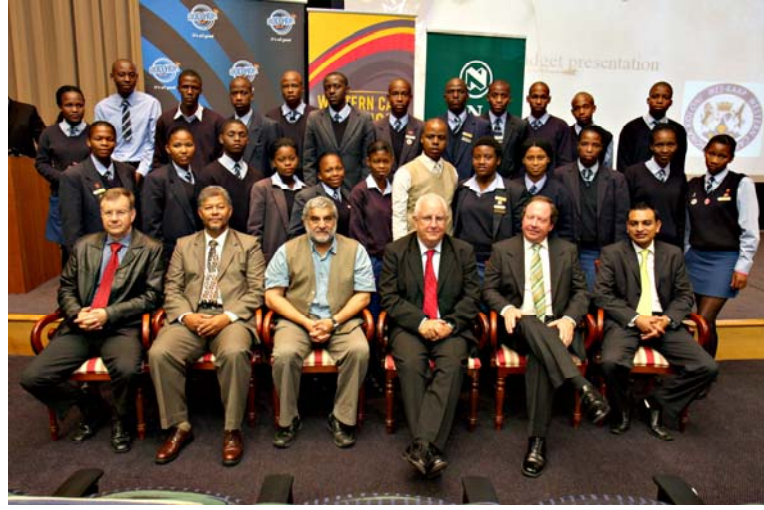
Representatives from Provincial Treasury, the WCED and Nedbank with learners from Masiphumelela Senior Secondary School.