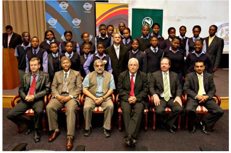
Representatives from Provincial Treasury, the WCED and Nedbank with learners from Sophumelela Senior Secondary School.