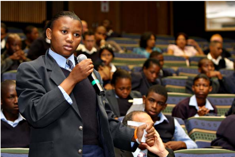
Learners posed questions to the panel during the event's question and answer session.