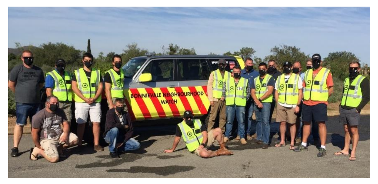
▲ The Bonnievale NHW team with their patrol vehicle.

The Bonnievale NHW was registered on 17 February 2021. We started out with nine patrol members who used their own vehicles. We now have 32 members. The members would be booked at the local police station pre-patrol and we would receive an OB number for the particular patrol. We would then record in our "Patrol register" with the time of the shift as well as the names of the patrol members.