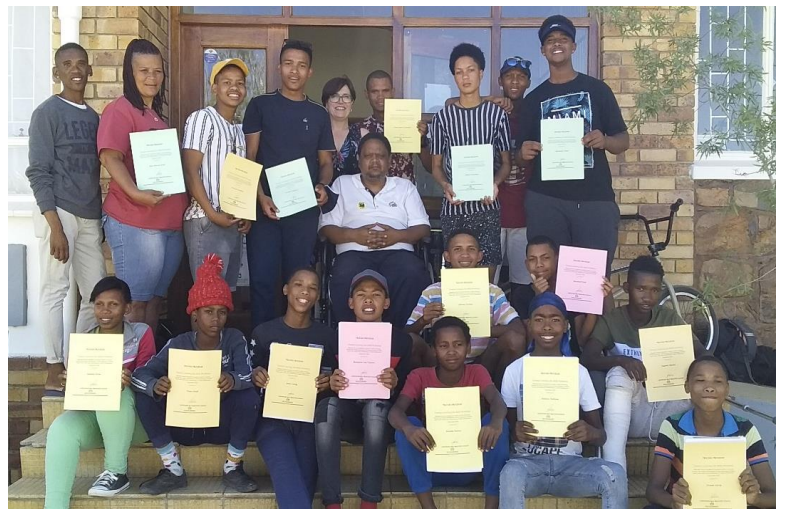
▲ The Klaarstroom NHW hosted a Victim Empowerment workshop for the youth of the community.

Klaarstroom is a small satellite station which falls under Prince Albert, situated between Beaufort West and De Rust. You will find it just before the legendary Meiringspoort. During rainy season, the NHW assists the police with helping visitors who need to pass the flooded poort. They keep travelers safe while keeping the poort closed. Accidents sometimes happen during the night and if the NHW needs to work throughout the night, they do so with pride.