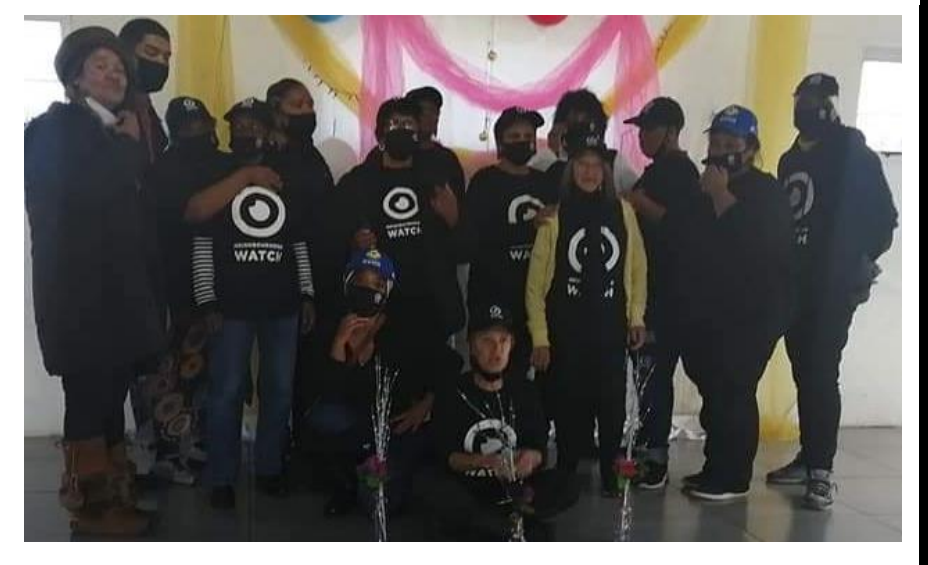
▲ The members of the Resident's Watch NHW in Pelican Park at the Women's Day brunch on 9 August 2021.

On 9 August 2021 Resident's Watch NHW based in Pelican Park hosted a Women's Day brunch and information session. The event was sponsored by City of Cape Town, Classic Meat and Standard Bank. Their support contributed to the success of the event.