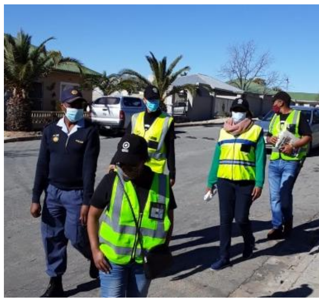
▲ The Piketberg NHW pictured at the patrol that took place on 17 July 2021.