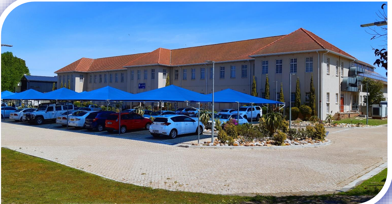
Front parking area of Gene Louw Traffic College